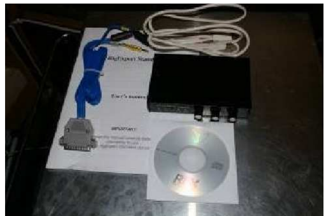
Photo 2 – Contents of the long awaited packet. All the items are of high quality.

Here too Rig expert gets bonus point for proper packaging and supplying quality equipment. Again you feel satisfied with the product you received.