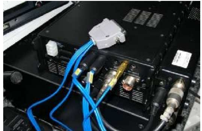
Photo 4 – Hooking this baby up to my FT 897 was a synch... all new installations should be this easy.

It then installs an additional 4 comports on your PC, not only allocating each of these to the functions ranging from CW and PSK to Rotator interfacing and TNC. It also is a USB to RS232 interface. Now the costs are starting to make more sense. This is not a singular device but rather a DIGITAL STATION in a BOX.