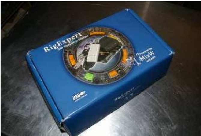
Photo 1 – The packaging of the Rig Expert is very appealing to the eye. Somehow I just couldn't get it over my heart to rip open the box....

I must point out that the staff at Rig Expert was very friendly and reacted prompt to all my requests and e-mails.